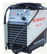
Misnco plasma source