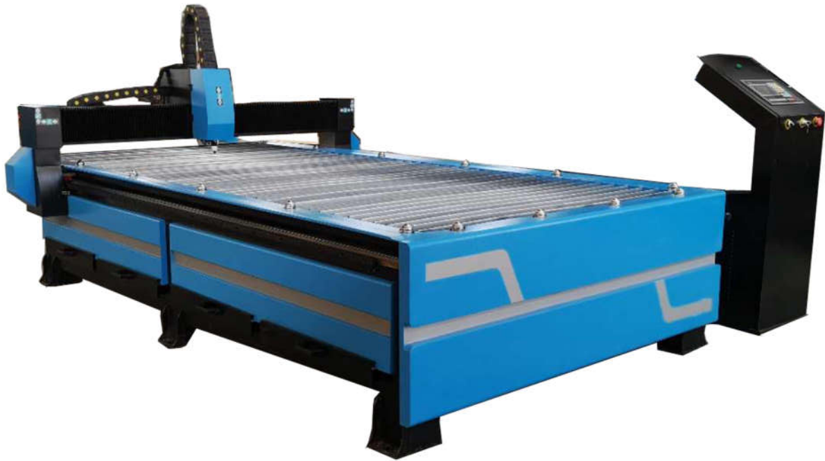
Table CNC cutting machine, with the stable performance. It used for the AD industry. With the dual drivers, it can supply the high speed cut and with the long-time working. The machine supports the dust fan and drawer.