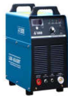
Huayuan plasma source