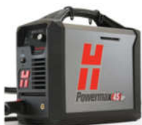
Hypertherm plasma source